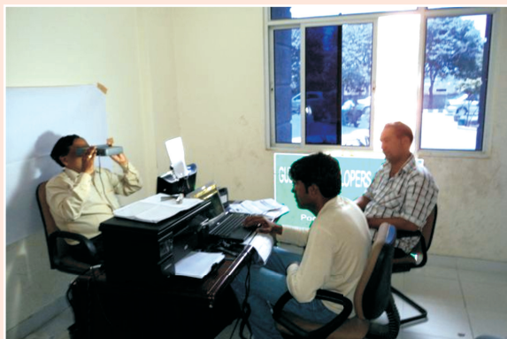
(NSDL commenced the enrollment process of Residents for AADHAAR conducted at Ghaziabad, Delhi)

National Securities Depository Limited (NSDL) has been appointed as a Registrar by Unique Identification Authority of India (UIDAI) for enrolling residents following the protocols, standards, processes and guidelines laid down by UIDAI.